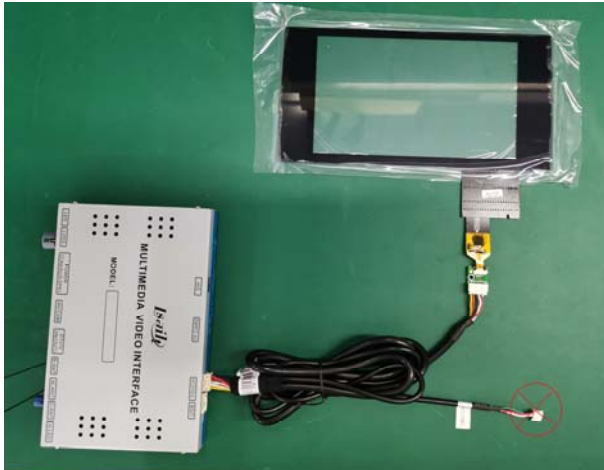
电容式触摸面板 Capacitive Touch Panel